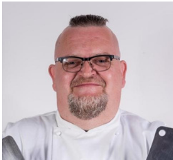
TROY Executive Chef