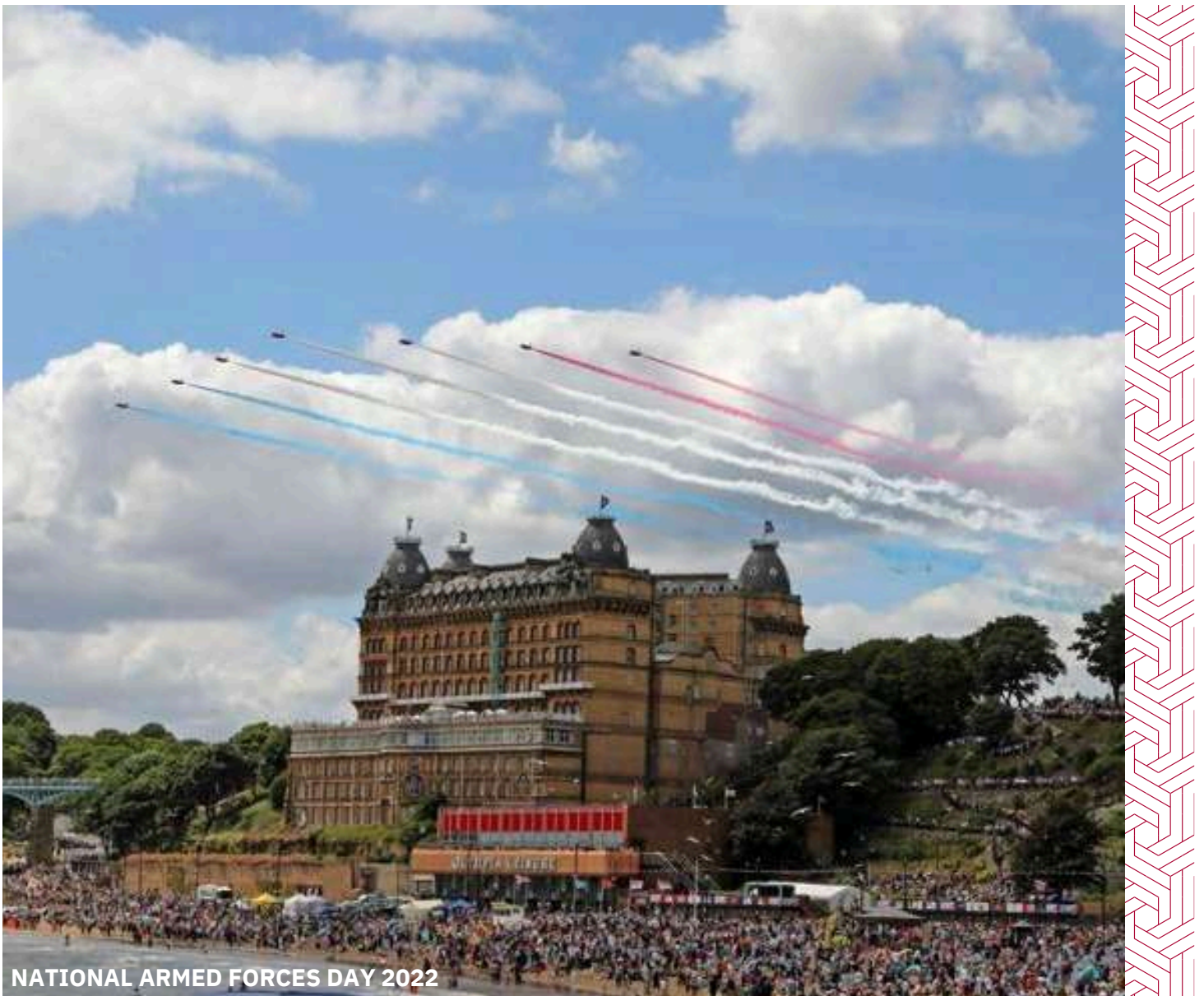
NATIONAL ARMED FORCES DAY 2022

Whether you’re planning a group holiday, a business retreat, or a celebratory affair, the Grand Hotel Scarborough delivers memorable experiences. With its stunning sea views, elegant interiors, and attentive service, it stands as the perfect destination for creating cherished moments and unforgettable experiences for your group.